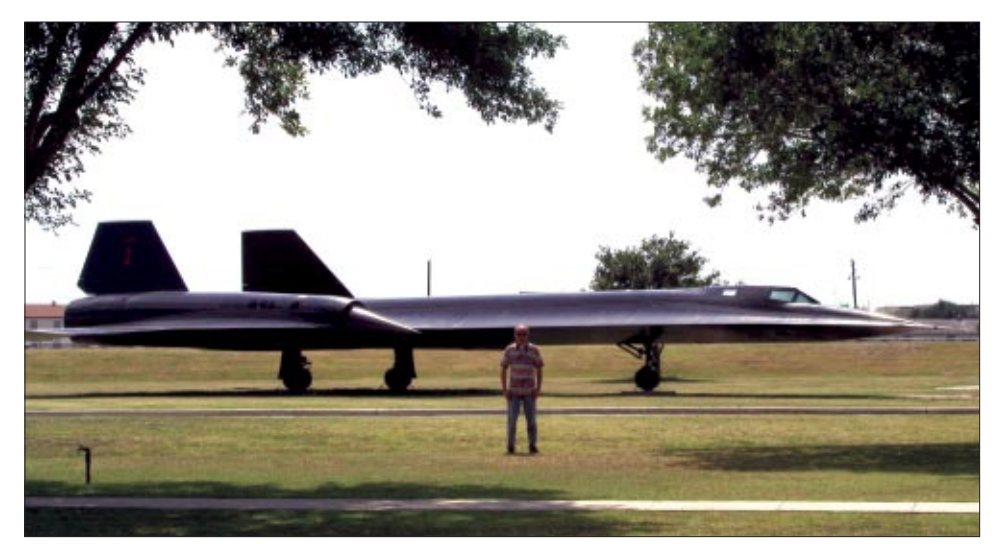
Fig. 1. The SR-71 Blackbird, Lackland Air Force Base, Texas. This photo of the author standing in front of the SR-71 was taken by the author's son Evan.

For several years I had no plausible explanation as to what had occurred. Does that mean the black cigar-shaped object was an alien spacecraft? I ask the students if they would jump to this conclusion if no