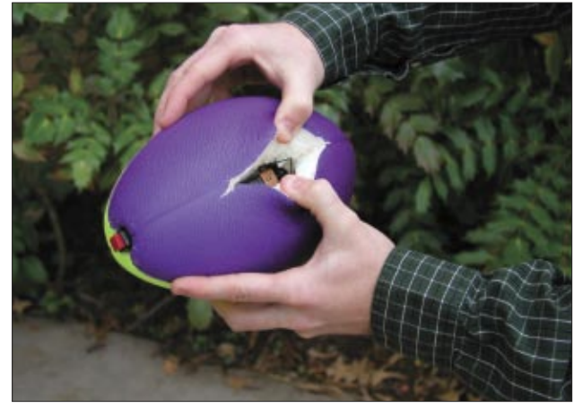
Fig. 1. Doppler Football.

Both the reed-whistle and beat-Doppler devices became common ways to demonstrate the Doppler